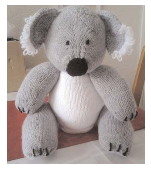
Lesley Jones creates an amazing collection of beautifully crafted items including this cudly Koala. To see many more pieces visit the IRR FaceBook page.