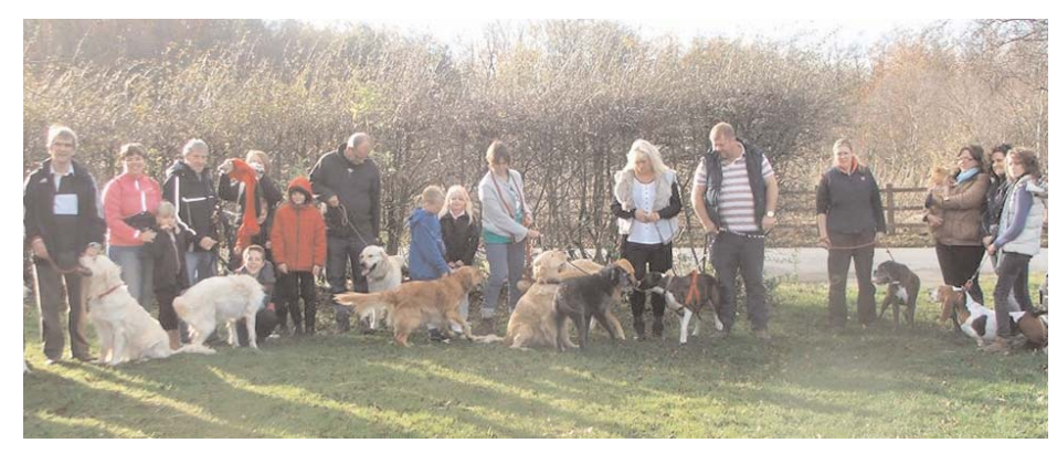
Paws Walk, Timsbury, Bath, October, Somerset

10+ Golden Retrievers were joined by Collies, Westies, Springer Spaniels, a Duck Tolling Retriever, a Viszla and others in the race down the beach to the waterfront - barking and leaping with joy. At the end of the walk refreshments were taken at the café and we raised £121 on the day!